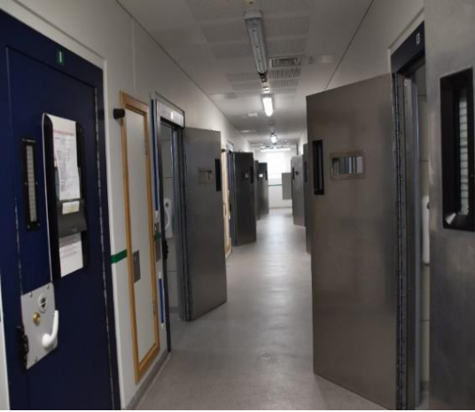
Image of Merthyr Custody Suite

South Wales Police operates 4 Custody Suites, and these are in Cardiff Bay, Merthyr Tydfil, Swansea, and Bridgend. The Custody Suites in Merthyr Tydfil and Bridgend were built in 2014 and are located away from the town centres. Each suite has 42 cells and are both identical in design. The oldest suite in the South Wales area is in Swansea with its estate being part of Swansea Central police station, with 27 cells. Cardiff Bay police station was completed in 2009 and the suite is designed over 2 levels, with 60 cells in total.