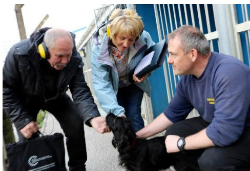
Image of a Police Dog with Animal Welfare Visitors at the Waterton Site

Visitors also monitor any dogs in kennels who are awaiting re-homing, in instances where they may have been rejected as police dogs or awaiting the retirement of their handlers. Visitors note any illnesses, injuries and look out for any indications of stress. The cleanliness of kennels, stables and the site are also noted.