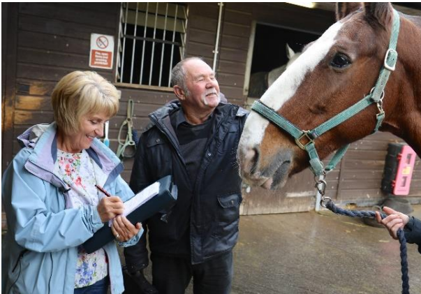
Image of a Police Horse with Animal Welfare Visitors at the Waterton Site

The South Wales Animal Welfare Scheme is currently facilitated by 9 volunteers. The volunteers carry out regular unannounced visits to the Dog and Mounted Section of South Wales Police to observe and report on the welfare, stabling and kennelling arrangements for police horses and dogs.